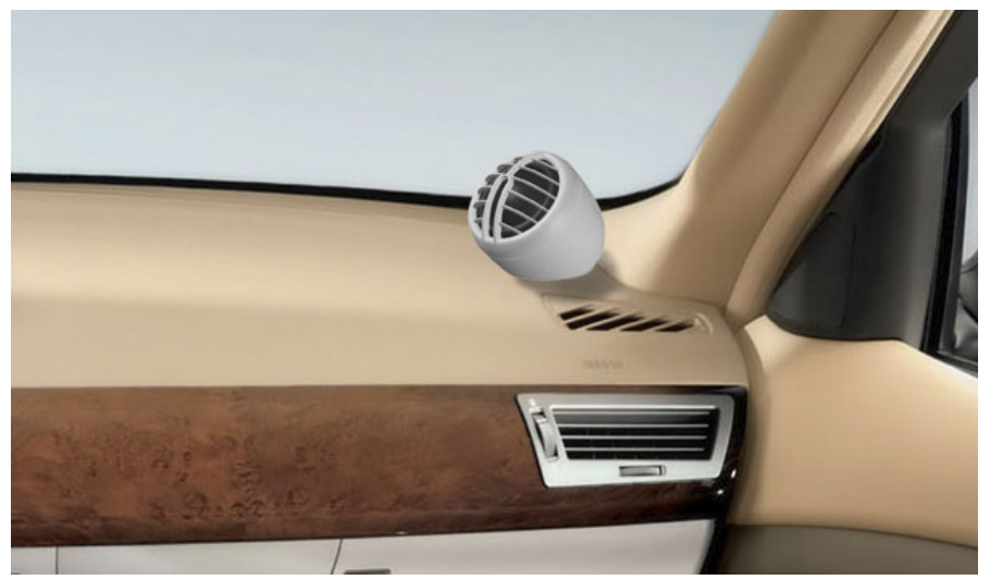
Wavecor's 30mm car tweeter angle mounted